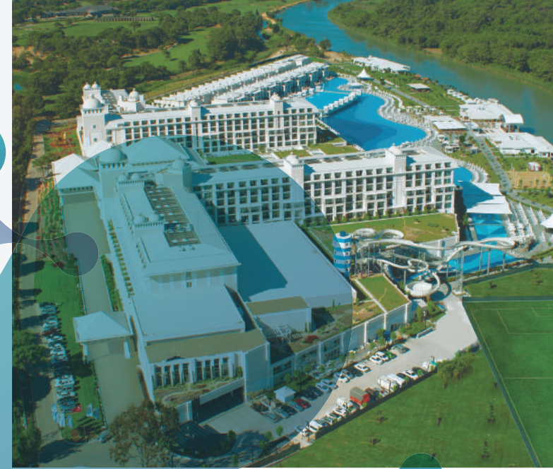
Titanic Deluxe Golf Belek

The symposium will host ISO TC 209 delegates from 23 member countries developing ISO 14644 standards and we will be getting first hand information about the future of the standards. This will also be our first hosting for the annual meeting of ICCCS CoD meetings and board of directors in our country. During three days in full, we plan to make you meet global brands and important names of the sector and make the best of it through different panels, trainings, technical trips and sessions.